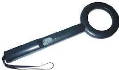
Hand held Metal Detector (HHMD)