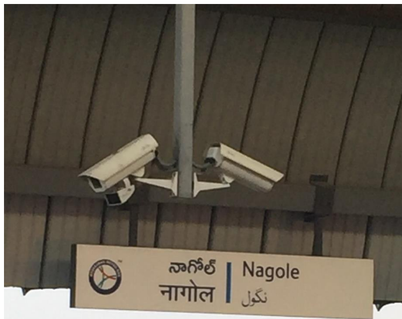
High Resolution cameras at Metro station