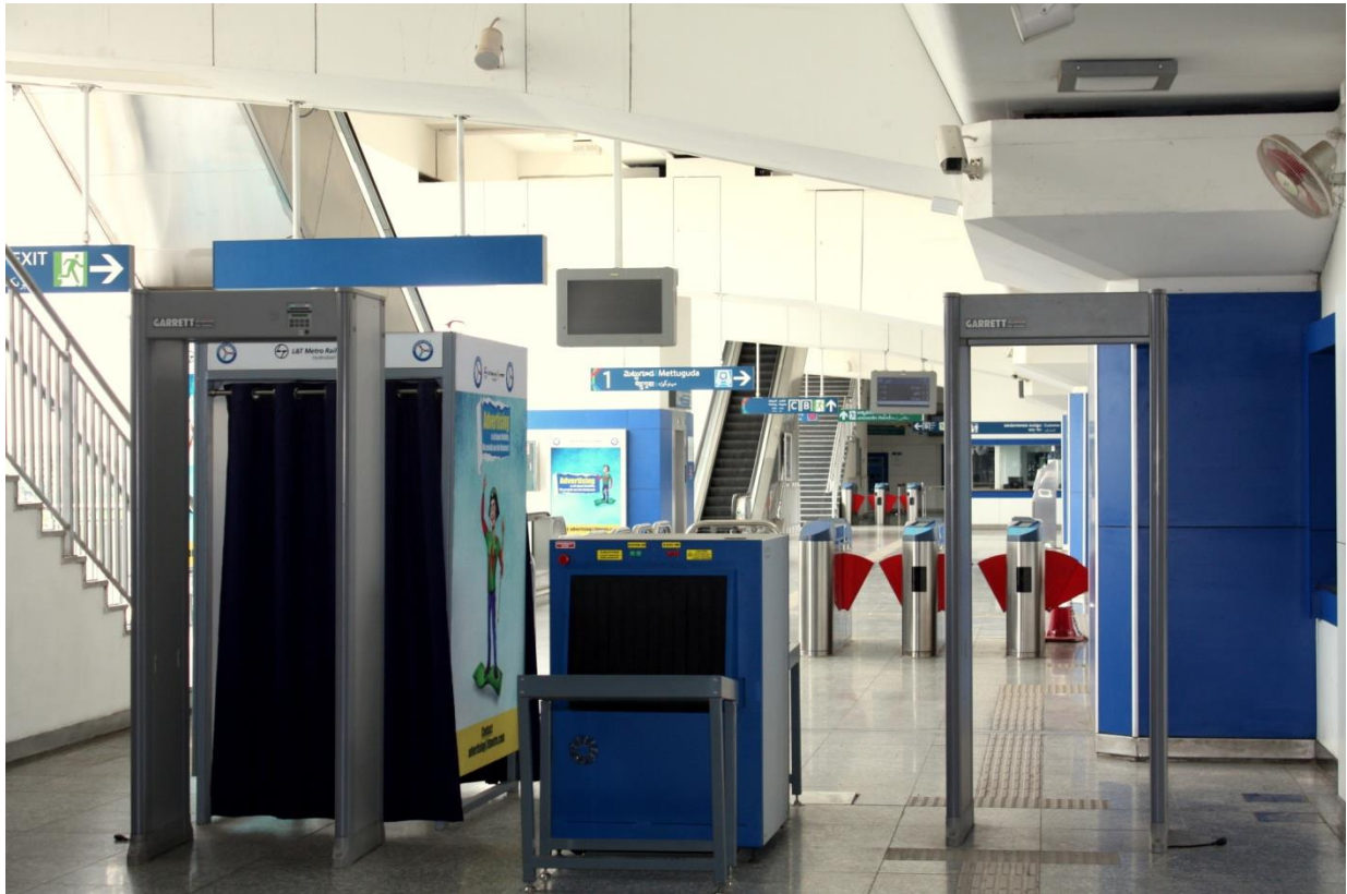
Baggage scanner and Door Frame Metal Detectors (DFMD) at Metro station