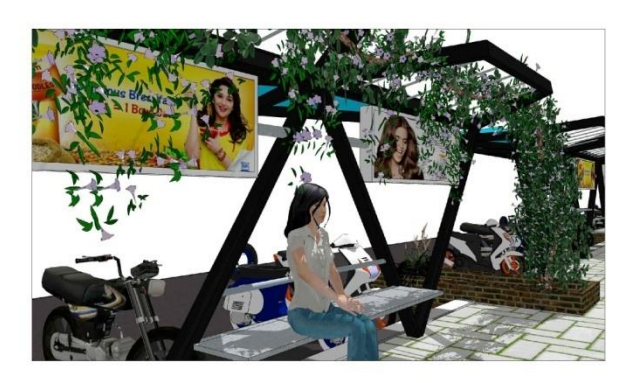
Aesthetic parking areas proposed to be developed at Metro stations