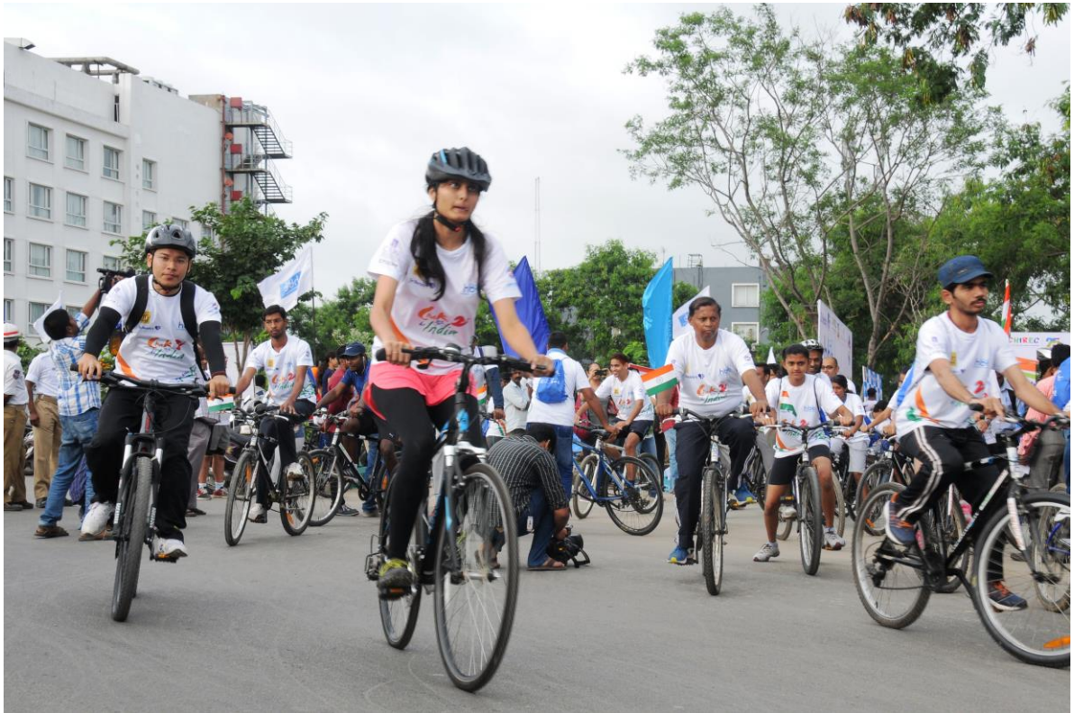
Enthusiastic participants in the 2 nd Chak de India Cycling event at Gachibowli, Hyderabad on Sunday (August 07, 2016)