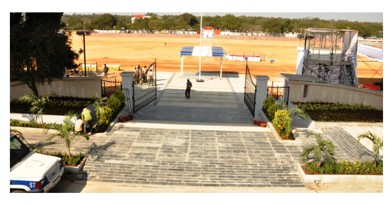
Entry to Parade grounds as developed by HMR