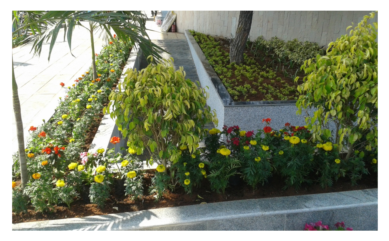
Beautification and pedestrian facilities developed by HMR at Parade grounds