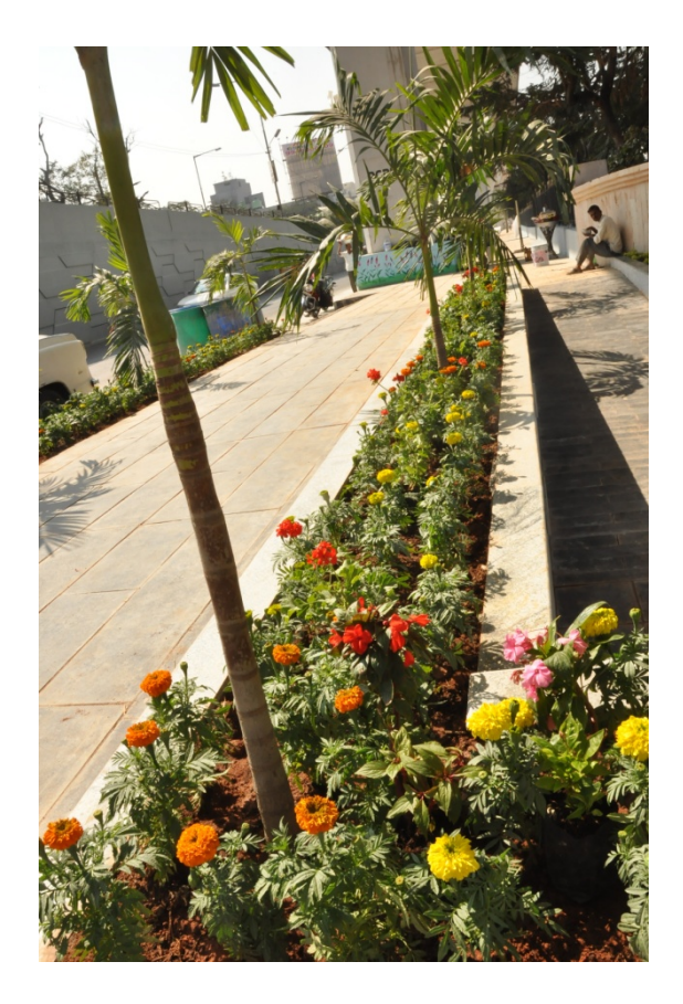
Beautification and pedestrian facilities developed by HMR at Parade grounds