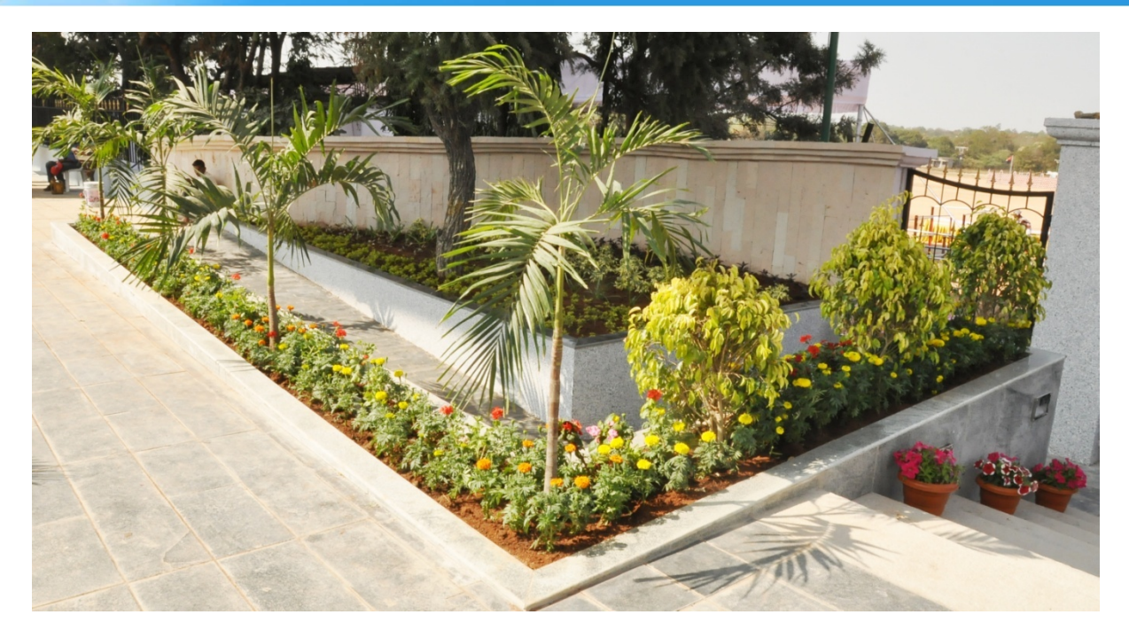
Beautification and pedestrian facilities developed by HMR at Parade grounds