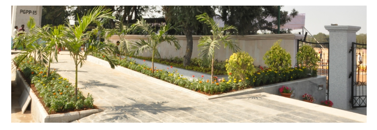
Beautification and pedestrian facilities developed by HMR at Parade grounds