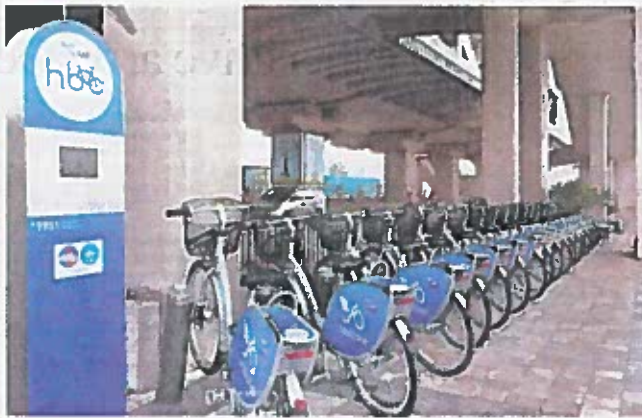
BIG PLAN: HMR intends to offer 10,000 bicycles through many bike stations on all the three corridors.

the cycling facility, he said modalities were still being finalised. There will be quite a few options for the users such as monthly passes, app-based, pay and use option etc., he added.