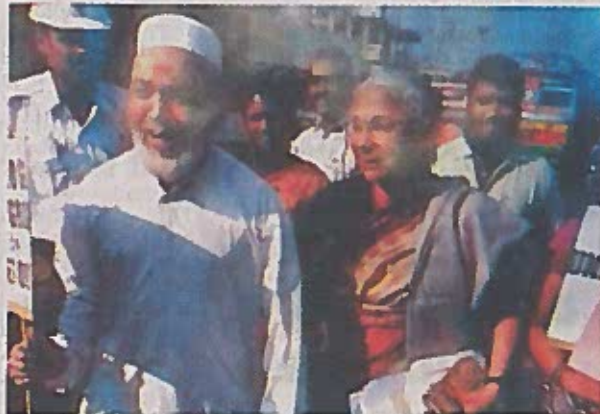
Social activist Medha Patkar seen leading the agitation against the Hyderabad Metro Rail project in 2012.

An HMR official said, "The photo exhibition is only to show the commitment of the project towards the city. National Alliance of Peoples' Movements (N-APM) had also represented to the then Prime Minister Manmohan Singh to intervene and stop the project. They said the schools would be demolished as part of the project."